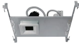
MAL2021 [Non-IC rated]