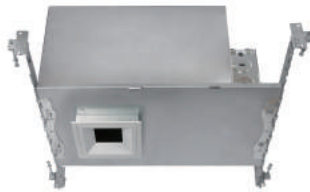
MAL202 [IC rated with outer box]